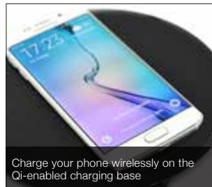
Charge your phone wirelessly on the Qi-enabled charging base