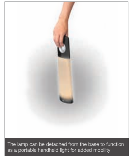
The lamp can be detached from the base to function as a portable handheld light for added mobility

By creating a magnetic field to induce voltage, Qi Technology enables users to wirelessly charge their mobile phones and other devices without using a cable.