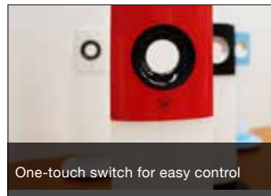
One-touch switch for easy control