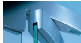
Glass Fittings and Accessories