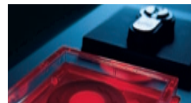
Security/Time and Access Control (STA)