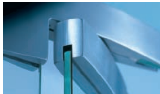
Glass Fittings and Accessories