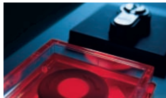
Security/Time and Access Control (STA)